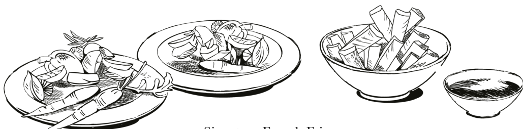
Signature French Fries, Baked Potato & Sour Cream oder Gemüsebeilage | 5 p.P. Chimichurri Sauce inkl.