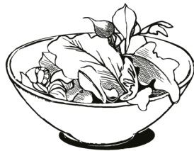
Salat | 10 p.P.